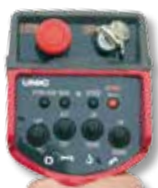
Radio remote control